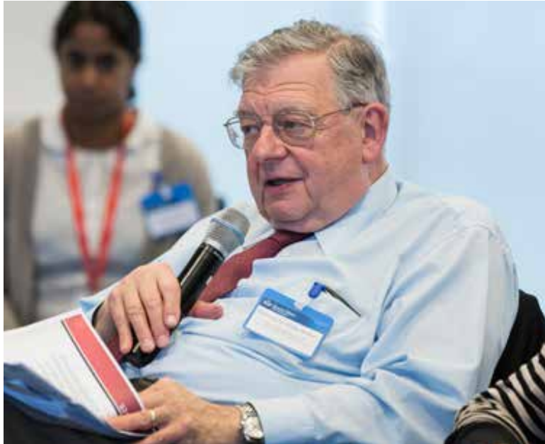
Figure 5: Professor Sir Walter Bodmer