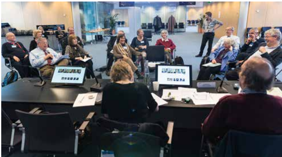
Figure 1: Participants at the Witness Seminar on Human Gene Mapping Workshops